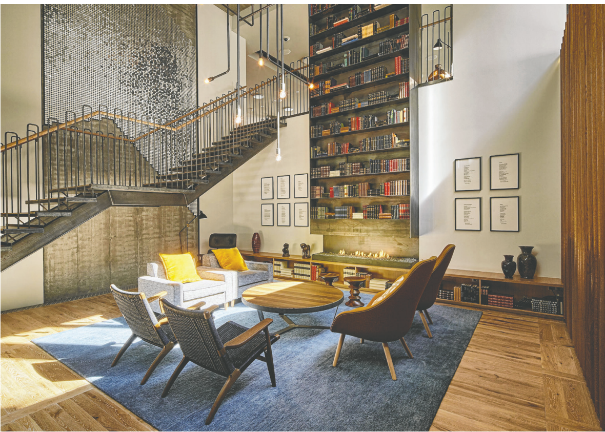
One of the many stylish amenities the Canopy by Hilton Reykjavik City Centre in Iceland offers is a lounge with a poet's corner. CANOPY BY HILTON REYKJAVIK CITY CENTRE

The walls are a gallery of thrilling avant-garde posters and photographs, and the library is an ode to Iceland, with antique sagas, framed Norse poems and art books. For a touch of retro,